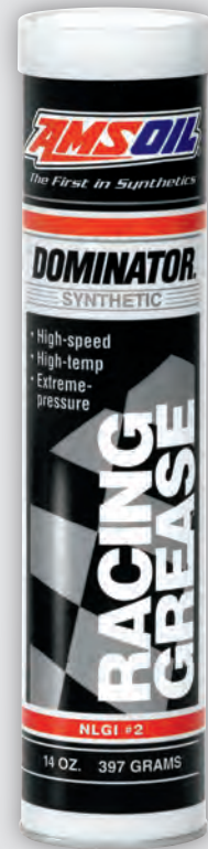
NLGI #2 GC-LB

DOMINATOR Racing Grease contains a robust package of oxidation inhibitors, helping prevent grease breakdown and component surface damage. Its excellent adhesion and cohesion properties allow it to resist water washout during operation in wet conditions. A premium blend of corrosion inhibitors further protects against rust and corrosion formation.