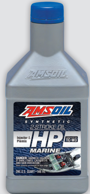
NMMA TC-W3 API TC

HP Marine is formulated with MAXDOSE™, a system of advanced additives for "super-clean" operation. It helps prevent deposits that lead to poor performance. In field testing, HP Marine inhibited ring deposits that can cause ring sticking and ring jacking (carbon build-up behind the ring, forcing it outward), a phenomenon that occurs in modern DFI outboard motors. It also virtually eliminated exhaust port deposits for reliable, efficient operation.