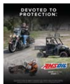
Powersports Shelf Talker (G3357)