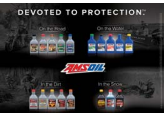
Powersports Counter Mat (G3353)