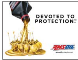
9x12 Window Decal (G3356)