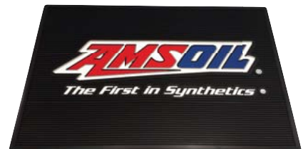
Floor Mat (G3369)