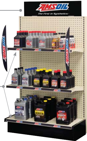
Three slide-in/pop-in Shelf Strips (G3361)