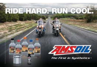
Motorcycle Counter Mat (G3354)