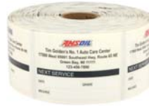
500 Custom Oil Change Decals (G3374)