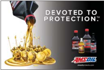
Retail Counter Mat (G3351)