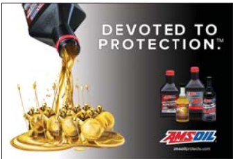
Retail Counter Mat (G3351)