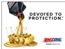
9x12 Window Decal (G3356)