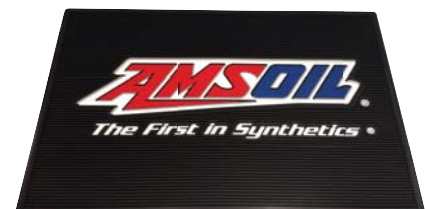
Floor Mat (G3369)