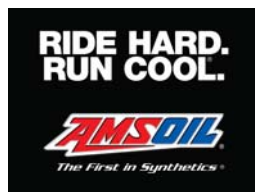
9x12 Motorcycle Window Decal (G3368)