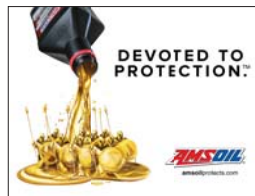
9x12 Window Decal (G3356)