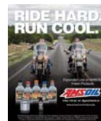
Motorcycle Shelf Talker (G3358)